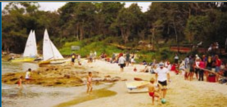
Part of the large crowd having fun