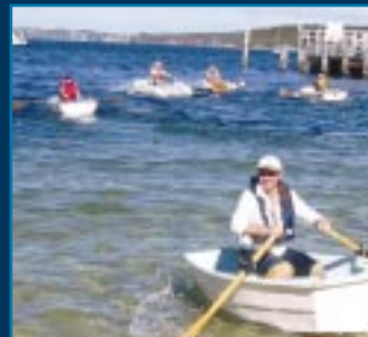
The start!