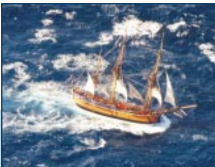
Endeavour battling force 10 gale in the Southern Oceans was captured by photographer Andrew Halsall