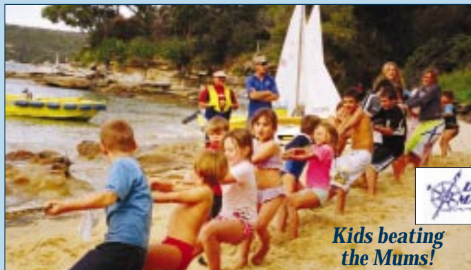
Kids beating the Mums!